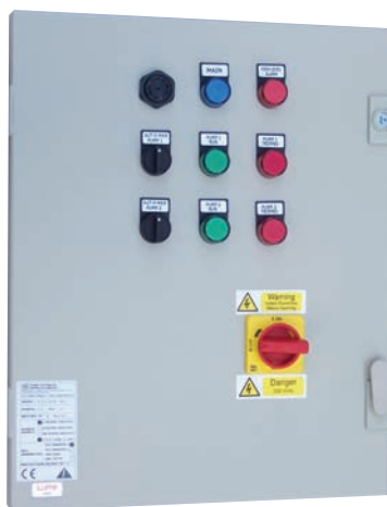
Dual Automatic Control Panel

We are able to supply the complete package including design, sales, installation, commissioning and maintenance.