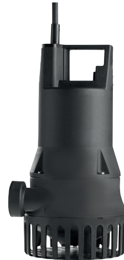
Oxylift 2 without level control