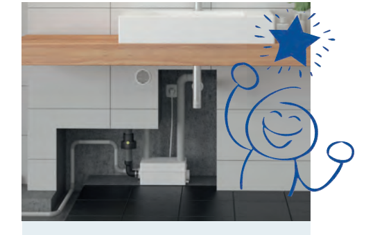
With dimensions of only 135 \times 320 \times 176 (H \times W \times D) mm he also fits comfortably into a pre-wall installation.