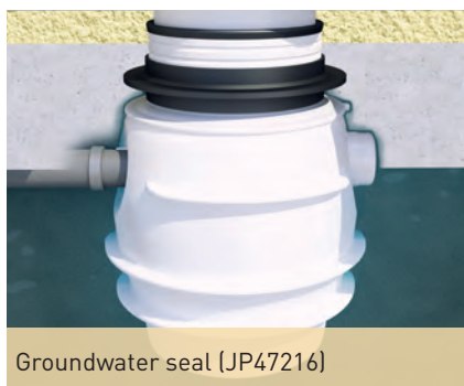
Groundwater seal (JP47216)