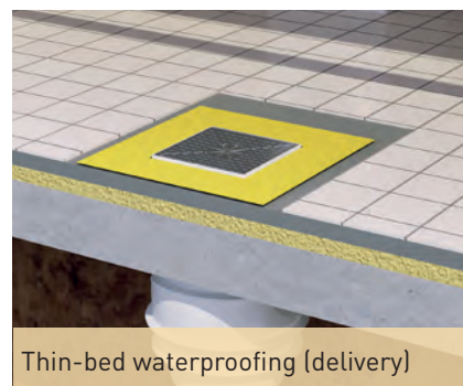
Thin-bed waterproofing (delivery)