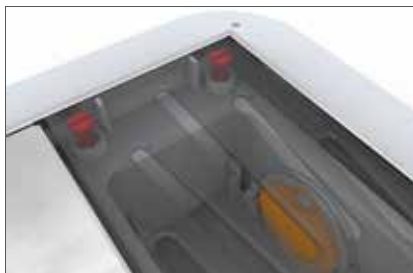
Height-adjustable cover/ non-return valve of side inlet