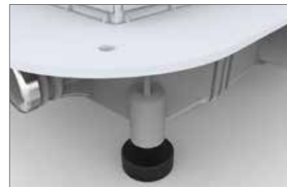
Rubber feet for noise reduction