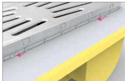
Secondary drainage to be opened if required